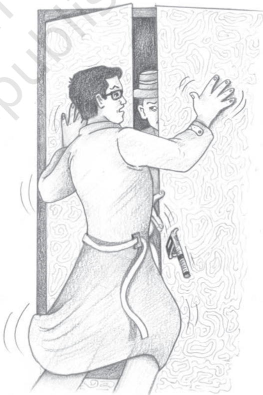
Gerrard gives him a push into the cupboard ...

GERRARD : I have got a man posted on the main road. He'll ring up if he sees the